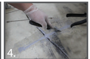
4. Scrape away excess epoxy