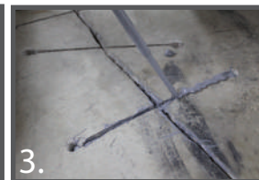
3. Apply epoxy over the Concrete Crack Lock®