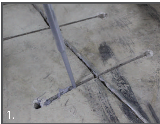
1. First fill hole

Tools: drill, 1/2 inch masonry drill bit