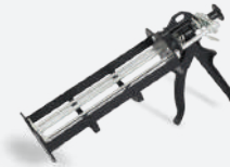
Rhino Carbon Fiber™ Dual Epoxy Gun 300/300 ml or 300/150 ml gun