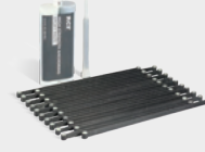
Rhino Carbon Fiber™ Concrete Crack Lock™ stitches Adds extra strength during repair