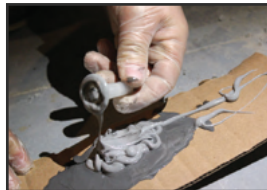
01: Roll port edge in High Strength Anchoring Epoxy Paste

Tools: gloves, disposable work surface, ports