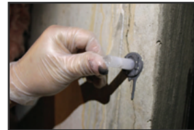
02: Press port firmly directly over crack