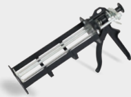
Rhino Carbon Fiber™ Dual Epoxy Gun 300/300 ml or 300/150 ml gun